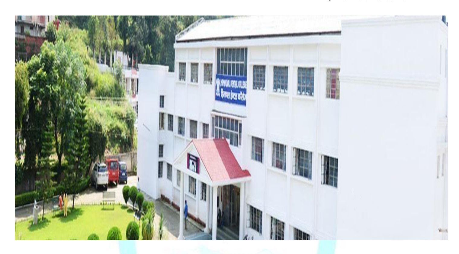
Himachal Dental College, Sunder Nagar, HP