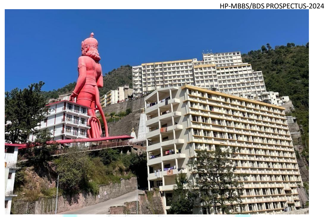
MM Medical College & Hospital, Kumarhatti-Solan (H.P)