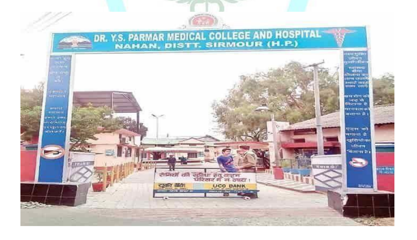
Dr. Y. P. Parmar Govt. Medical College, Nahan