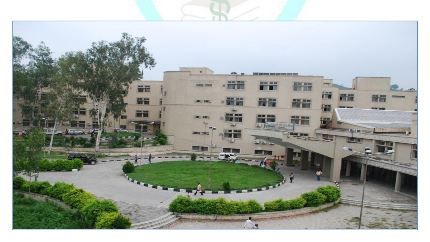
A VIEW OF Dr. R.P.G.M.C, TANDA AT KANGRA (H.P.)