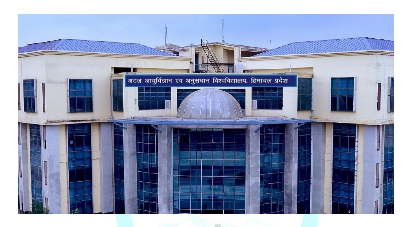
A VIEW Atal Medical and Research University, HP at Ner Chowk, Distt. Mandi