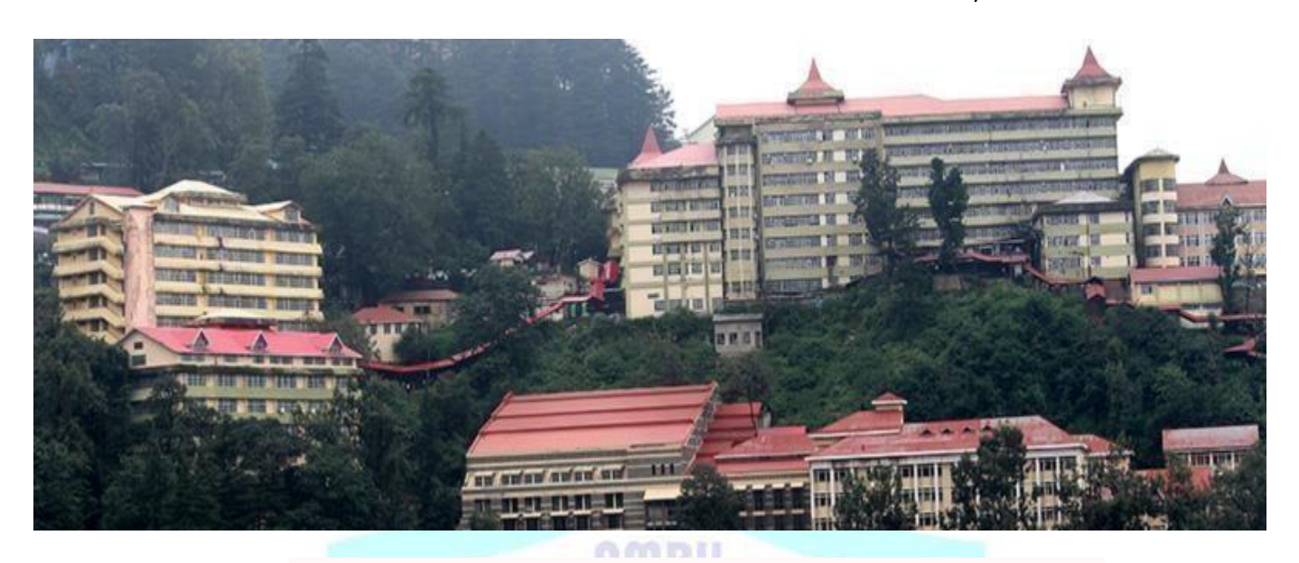
H.P. GOVERNMENT DENTAL COLLEGE & HOSPITAL SHIMLA (HIMACHAL PRADESH)