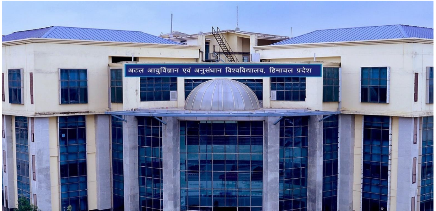
A View of Atal Medical & Research University, HP, Nerchowk, Distt. Mandi