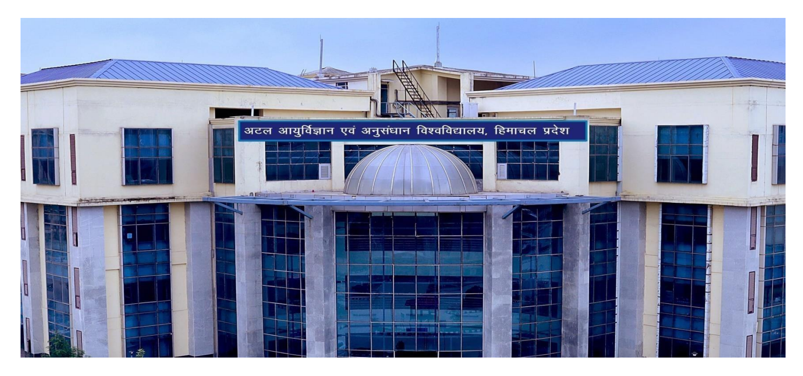
A View of Atal Medical And Research University, HP, Nerchowk, Distt. Mandi