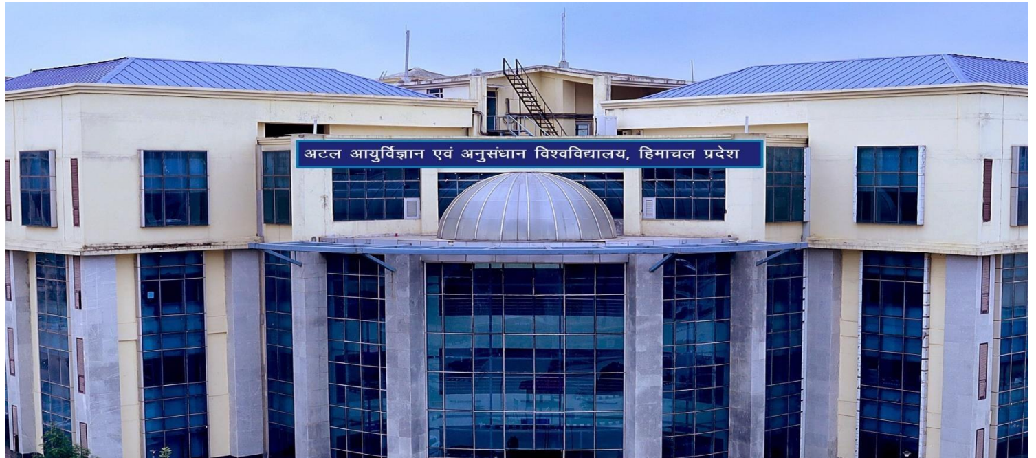
A View of Atal Medical And Research University, HP, Nerchowk, Distt. Mandi