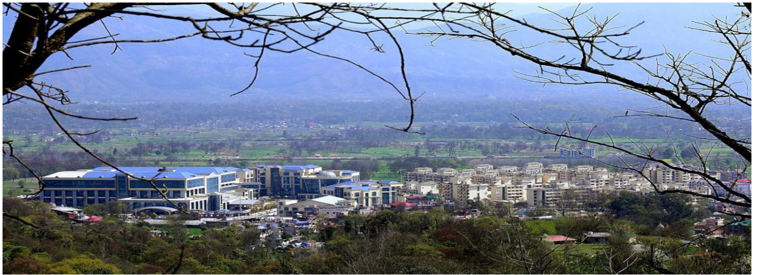
A View of Shri Lal Bahadur Govt. College & Hospital, Nerchowk, Distt. Mandi (HP)