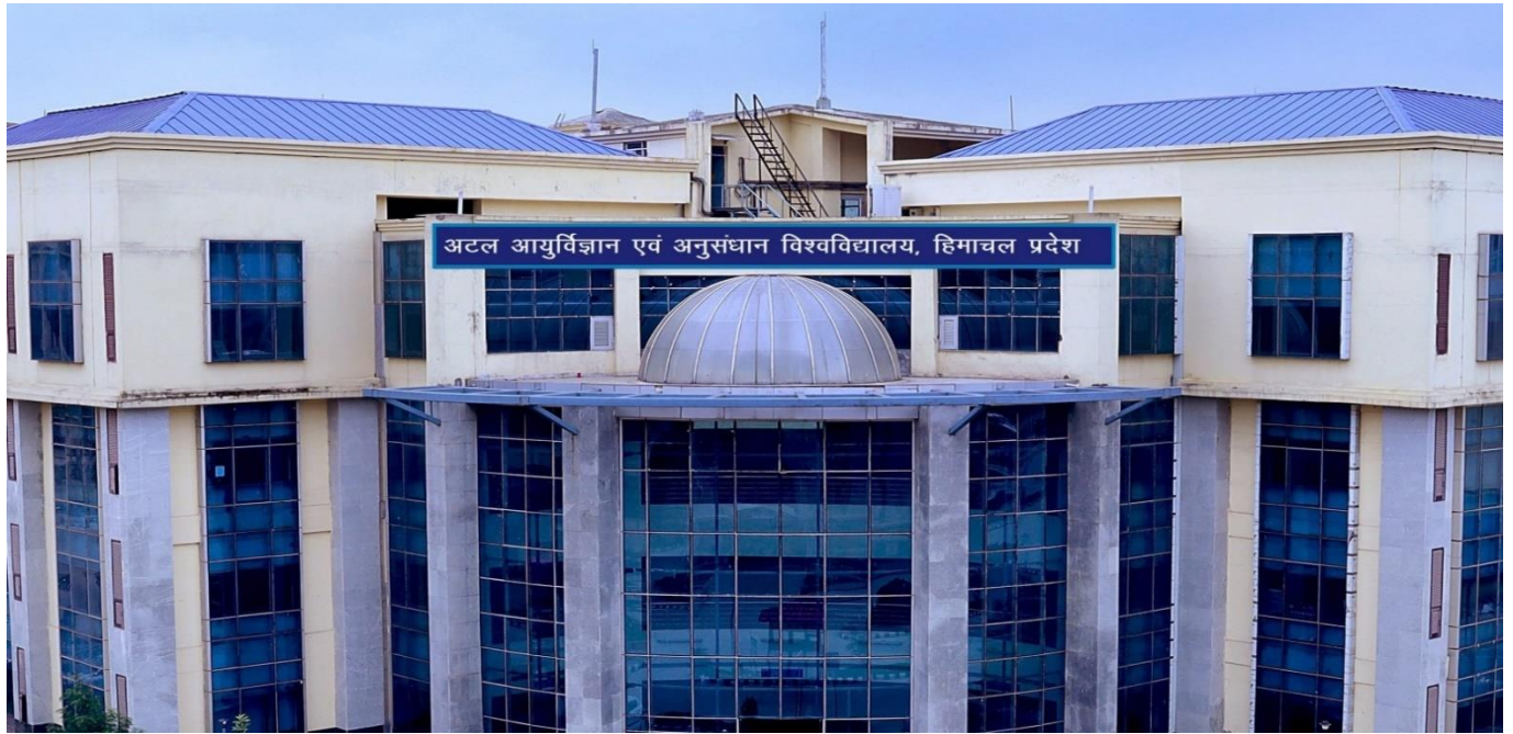
A View of Atal Medical & Research University, HP, Nerchowk, Distt. Mandi