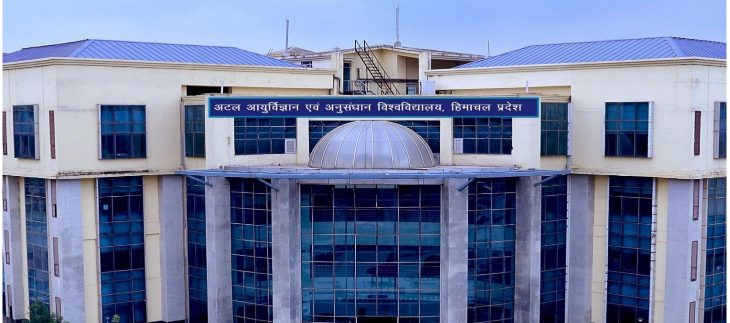
A VIEW OF ATAL MEDICAL & RESEARCH UNIVERSITY, HP At NERCHOWK, DISTT. MANDI