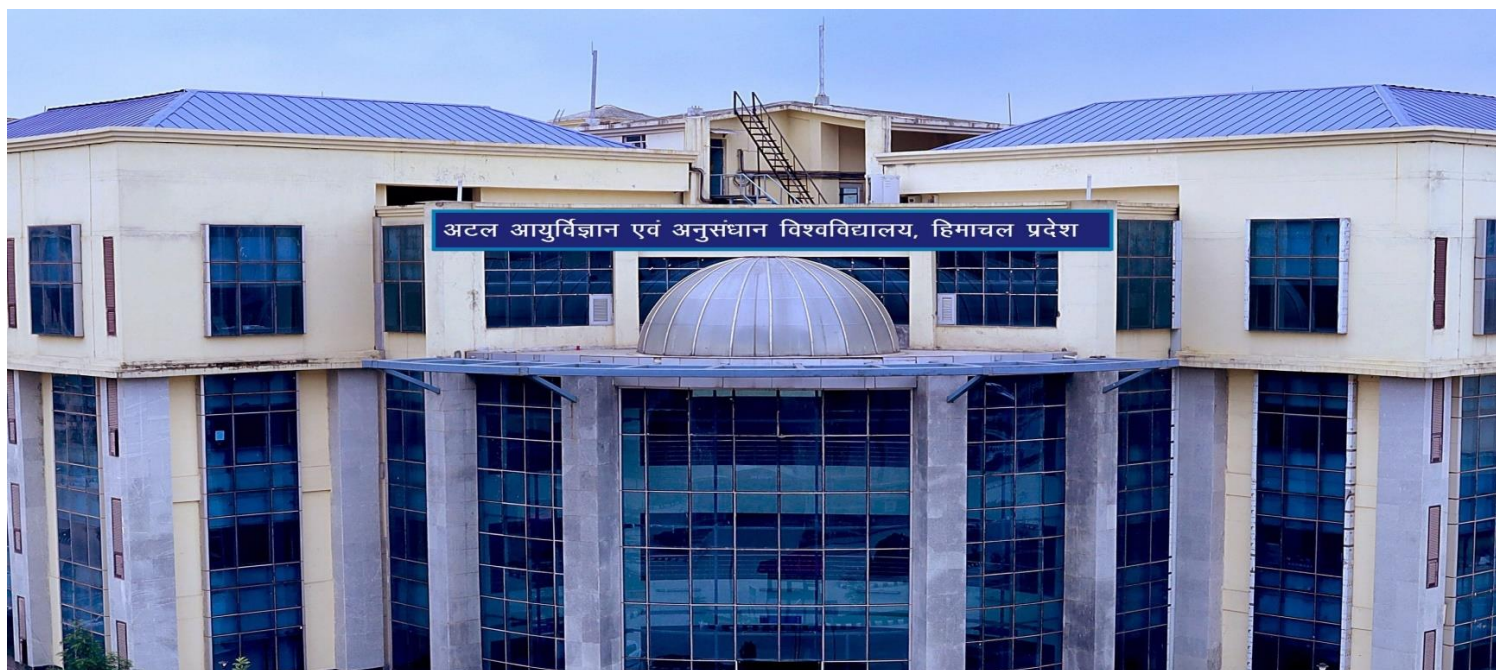
A View of Atal Medical And Research University, HP, Nerchowk, Distt. Mandi