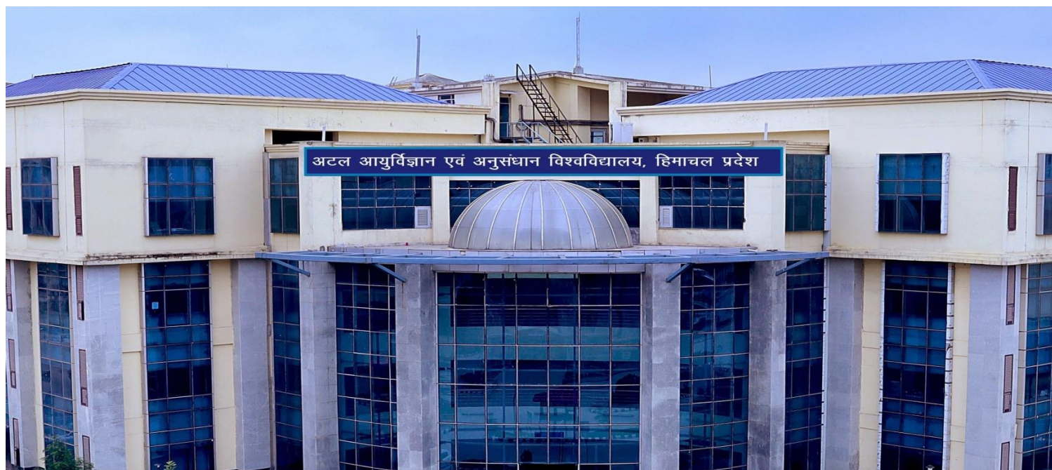
A View of Atal Medical And Research University, HP, Nerchowk, Distt. Mandi