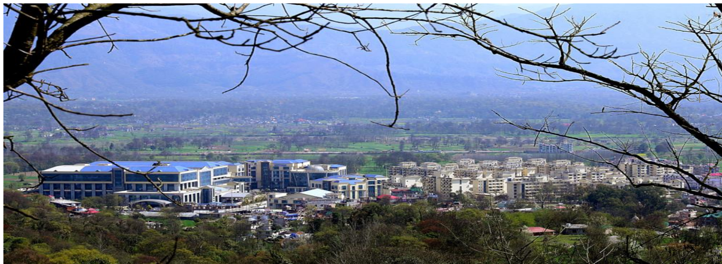
A View of Shri Lal Bahadur Govt. Medical College & Hospital, Nerchowk, Distt. Mandi (HP)