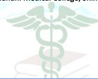
A VIEW Indra Gandhi Medical College, Shimla