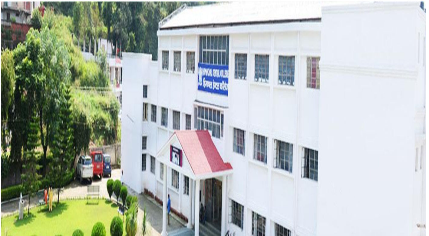
Himachal Dental College, Sunder Nagar, HP