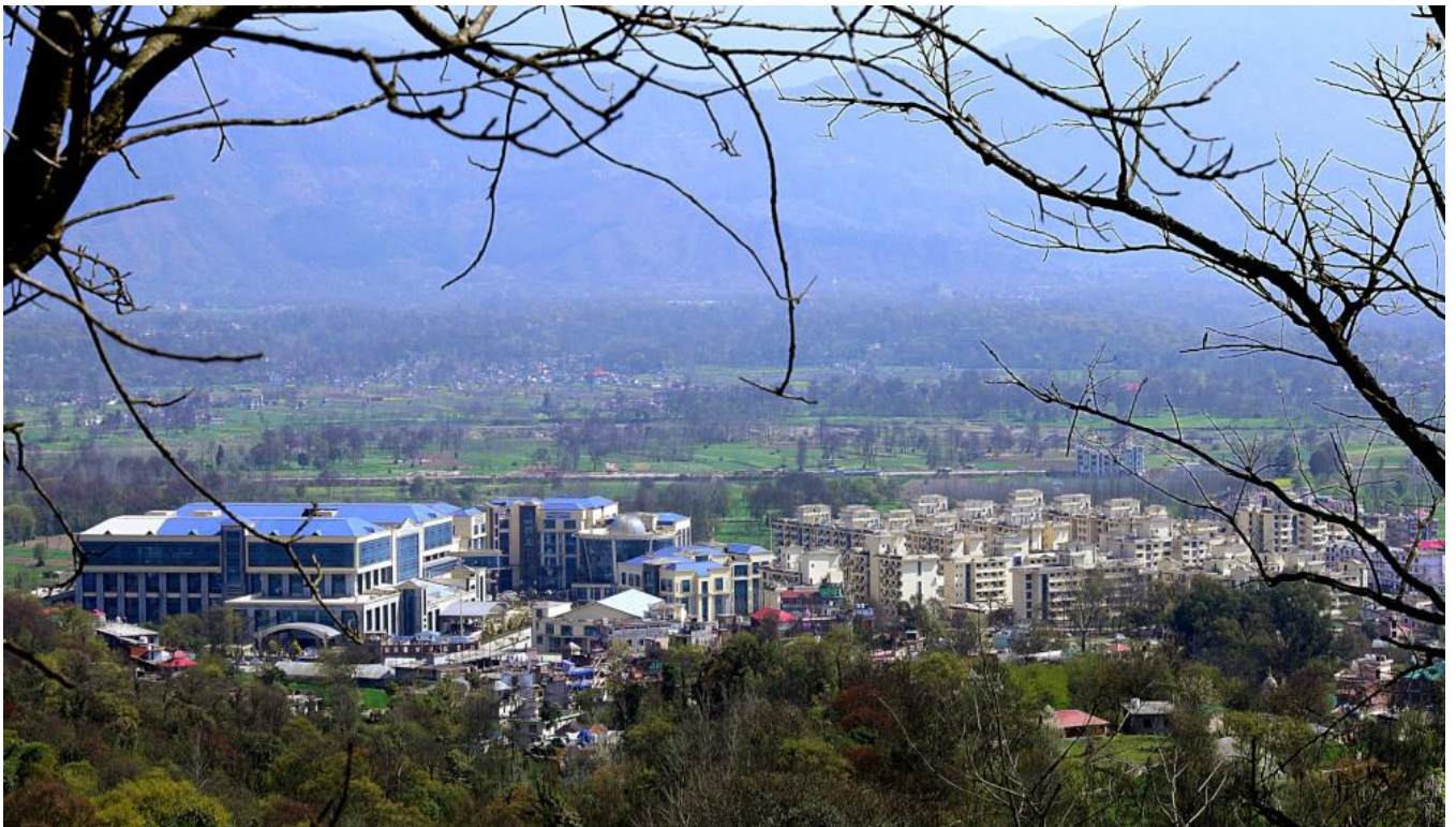
A View of Shri Lal Bahadur Govt. Medical College & Hospital, Nerchowk, Distt. Mandi (HP)