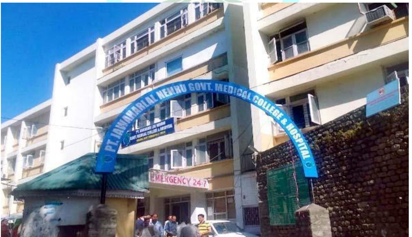
Jawahar Lal Nehru Govt. Medical College, Chamba