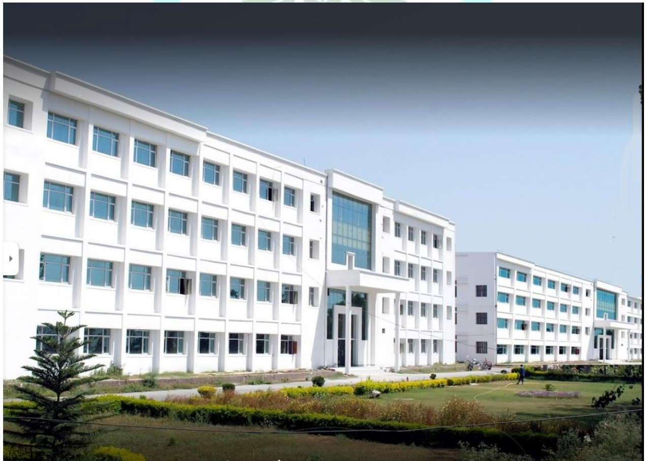
Himachal Institute of Dental Sciences, Paonta Sahib, Himachal Pradesh