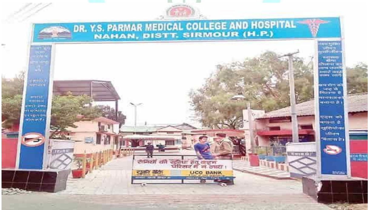
Dr. Y. P. Parmar Govt. Medical College, Nahan