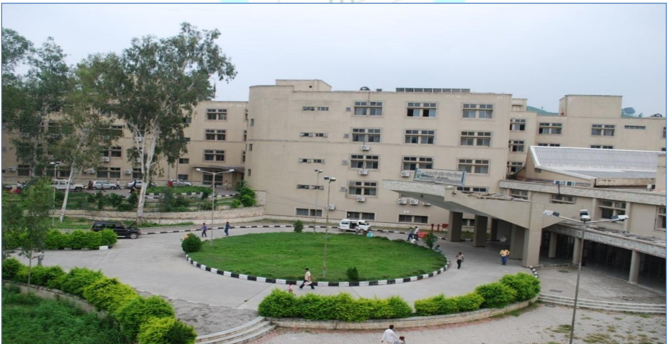
A VIEW OF Dr. R.P.G.M.C, TANDA AT KANGRA (H.P.)