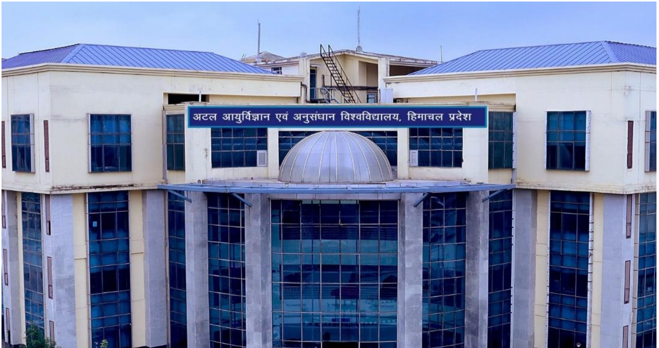
A VIEW Atal Medical and Research University, HP at Ner Chowk, Distt. Mandi