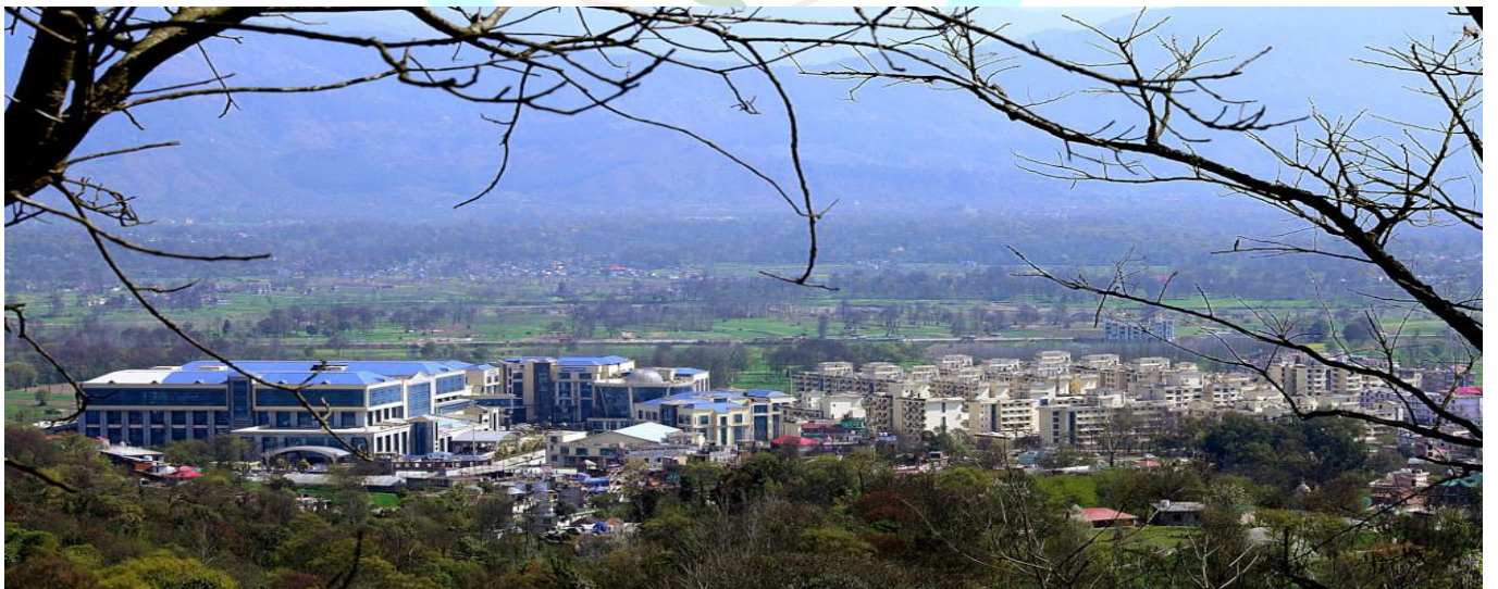
A View of Shri Lal Bahadur Govt. Medical College & Hospital, Nerchowk, Distt. Mandi (HP)