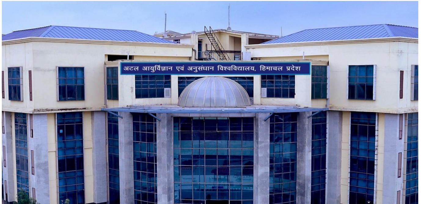
A View of Atal Medical & Research University, HP, Nerchowk, Distt. Mandi