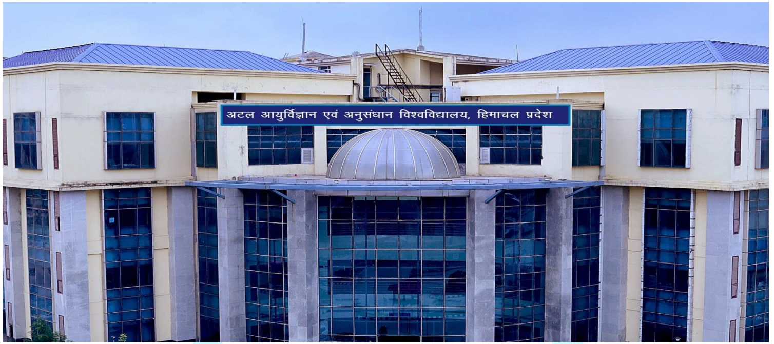
A View of Atal Medical And Research University, HP, Nerchowk, Distt. Mandi