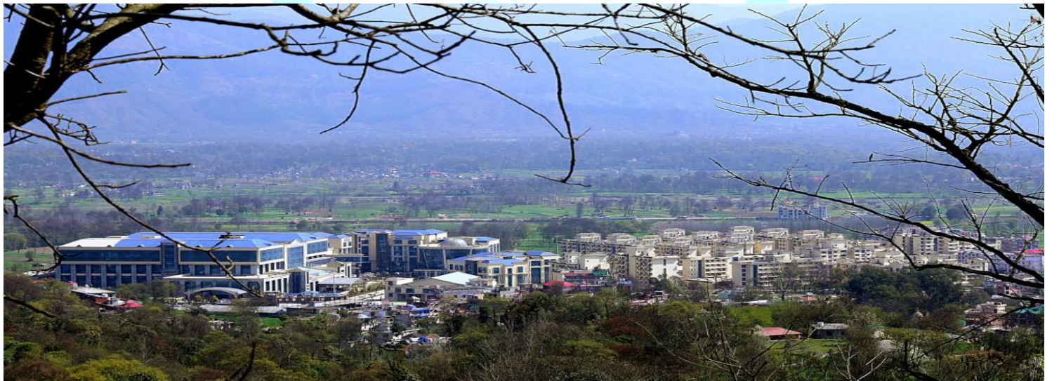
A View of Shri Lal Bahadur Govt. Medical College & Hospital, Nerchowk, Distt. Mandi (HP)